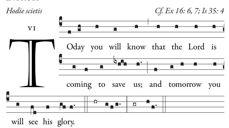
Psalm 24 (23)