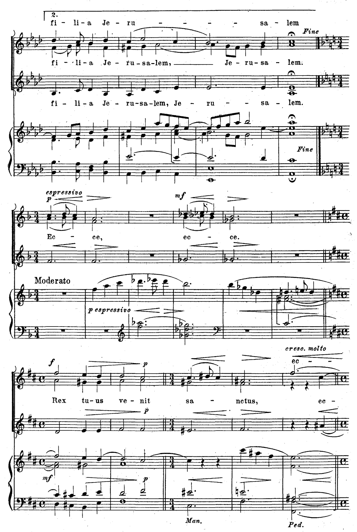
M.& R.Co. 716-4