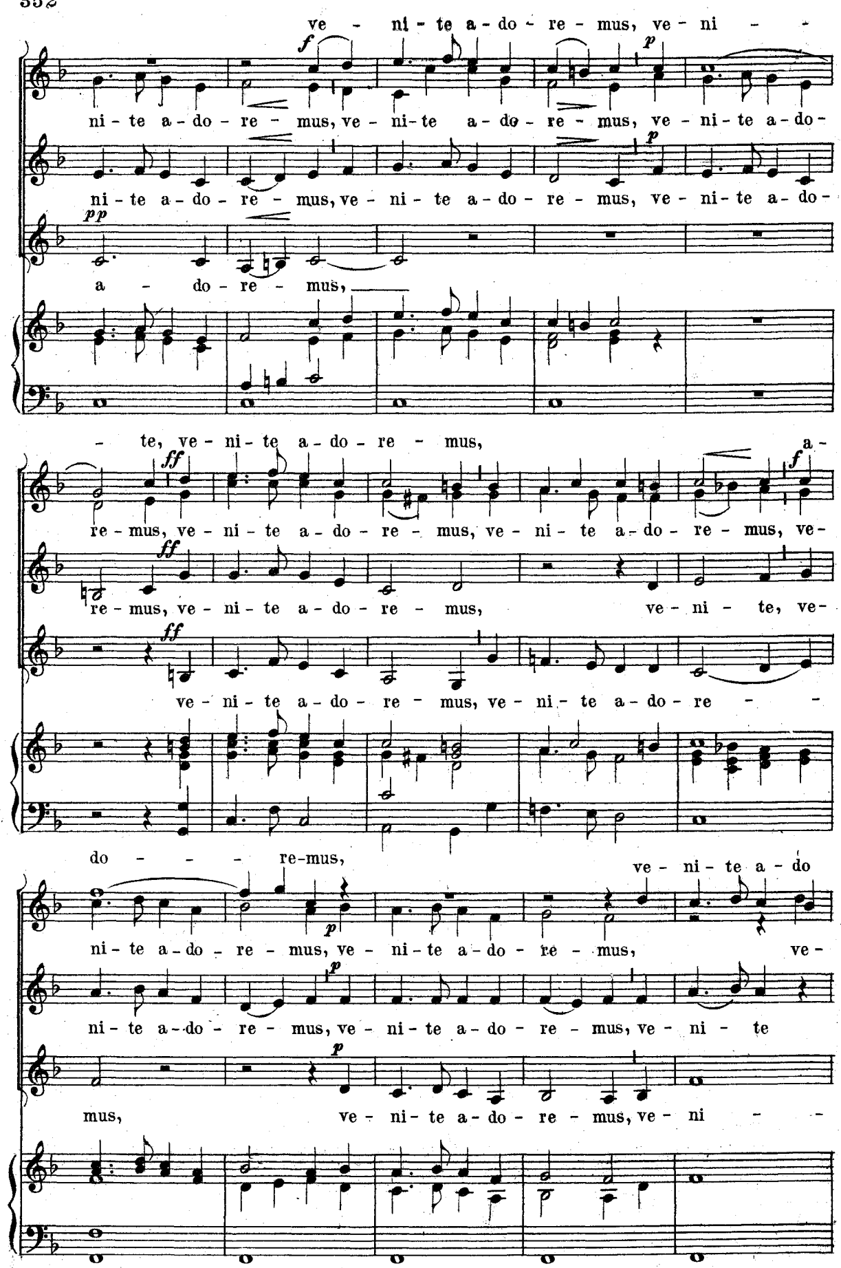
M. & R. Co. 687-4