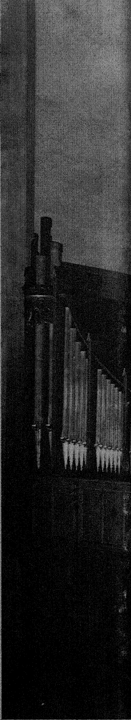
Schlicker Organ in the First Congregational Church, Los Angeles, California