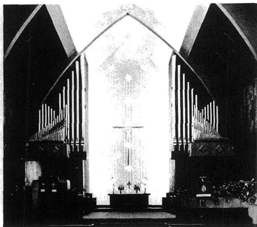
First Presbyterian Church San Pedro, California