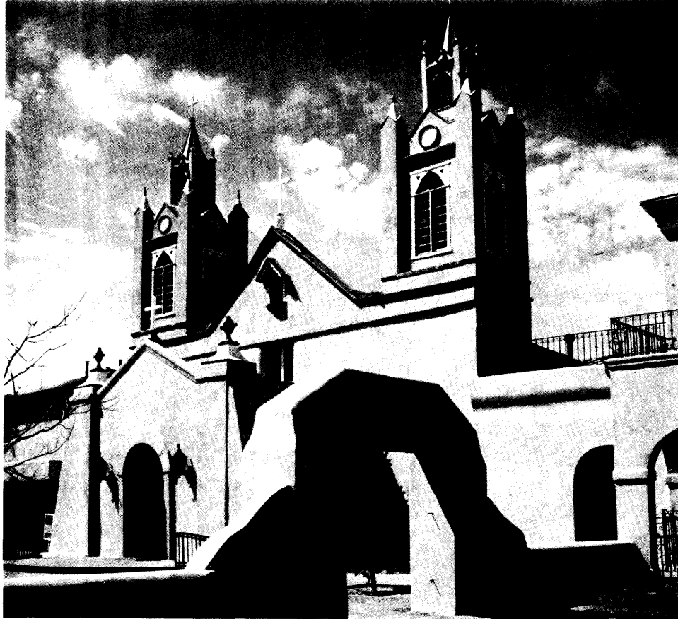
New Mexico Department of Development

San Felipe Neri Parish, Albuquerque, New Mexico