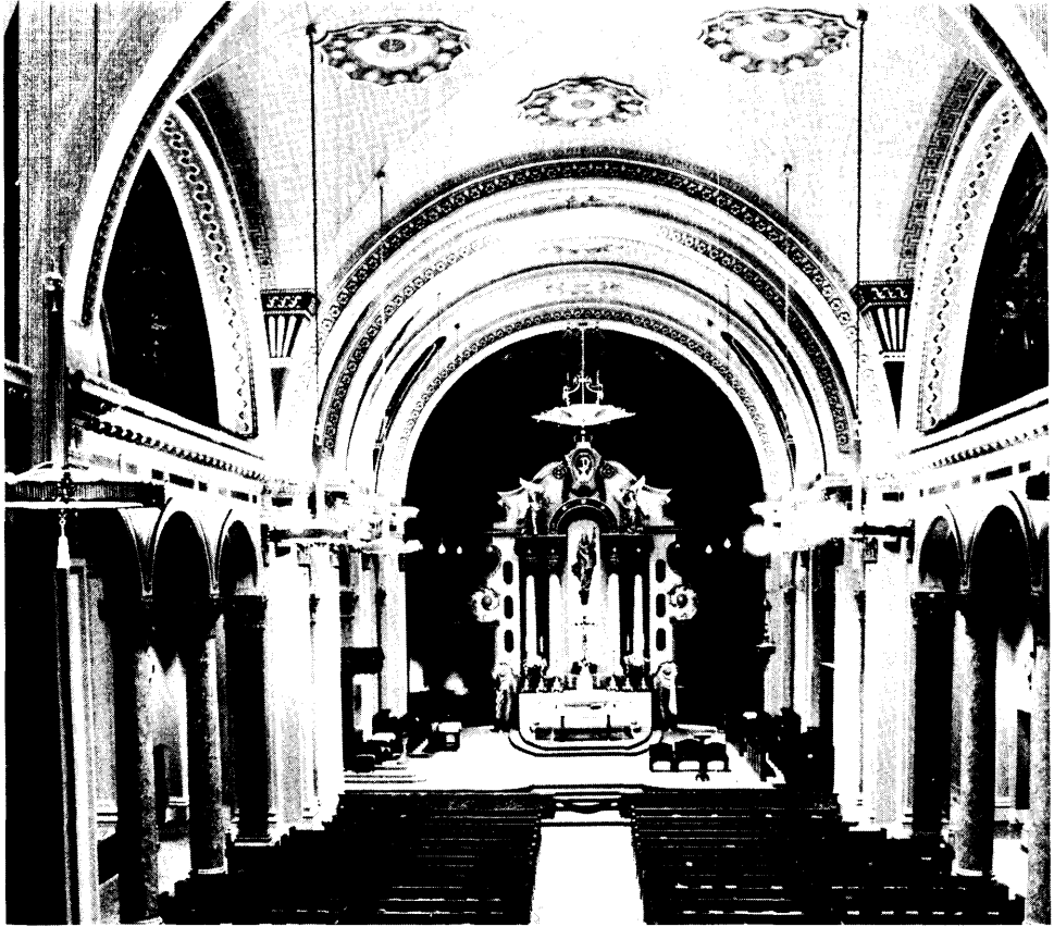
Interior, St. James Cathedral, Seattle, Washington