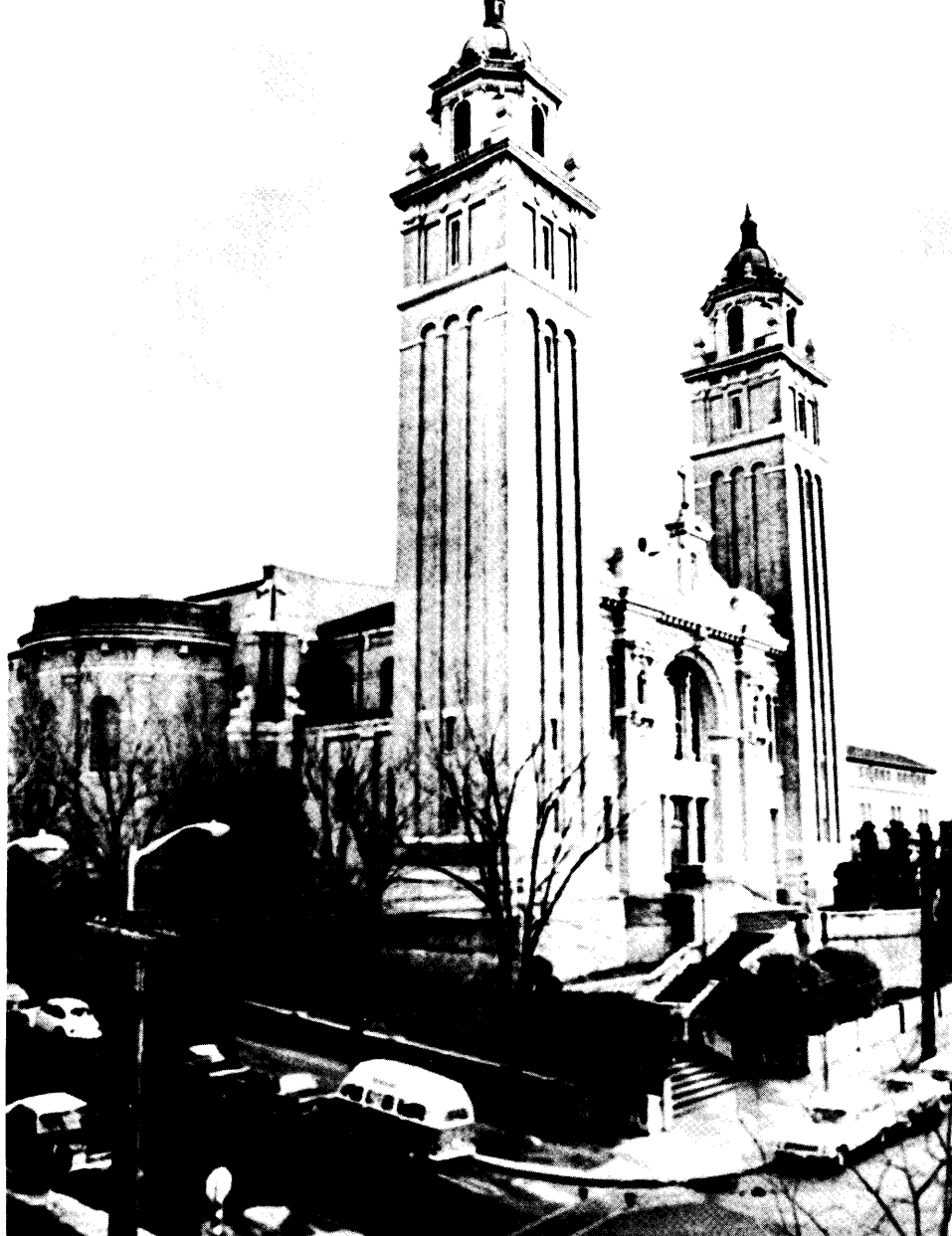
St. James Cathedral, Seattle, Washington