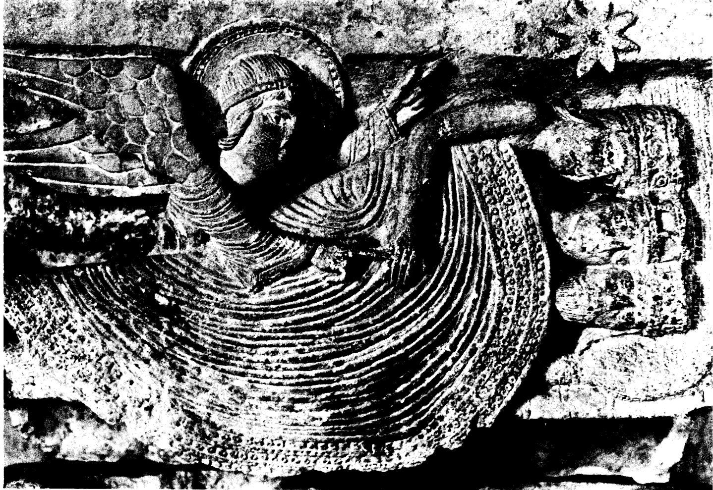
The Dream of the Magi, capital from the Cathedral of St. Lazarus, Autun, France