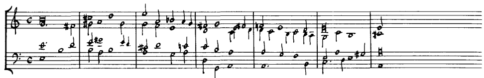
Example 4: Elevation toccatà : Frescobaldi, Toccata cromatica per l'Elevation 60

The genre which represents the most modern style is the toccatà . Short toccatàs usually introduce the Kyrie and sometimes the ricercar after the Credo . Their improvisatory character forms a point of contrast with the longer contrapuntal movements with which they are paired. This improvisatory character consists mainly in the application of a variety of soloistic passagework, but also in the implied variety of tempo which Frescobaldi prescribes for the toccatà . 58 It is also linked intimately with that direct sort of expression which was so characteristic of the early baroque, and derived ultimately from the madrigals of the late sixteenth century. The larger toccatàs , for the elevation, epitomize that kind of expression. They show less purely instrumental figuration, but rather, like the late sixteenth-century madrigal, incorporate unexpected harmonic progressions which often include chromaticism. They most often center around E, the Phrygian mode, suited to the expression of the mystical and the ineffable. 59