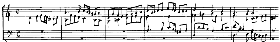
Example 3: Canzona style: Frescobaldi, Canzon dopo l'Epistola 57

A somewhat lighter style is that of the canzona . It derives from the French secular chanson of the sixteenth century, and it expresses a spirited kind of movement. The humorous elements of the chanson have, however, been turned to a somewhat more serious purpose in the greater use of counterpoint and variation.