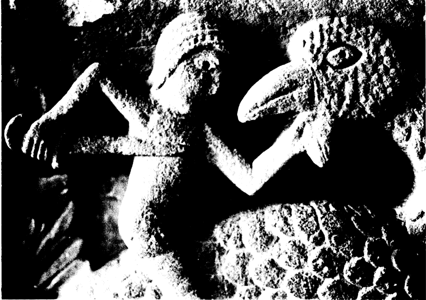
Fight with a basilik, detail of a capital from the Cathedral of St. Lazarus, Autun, France