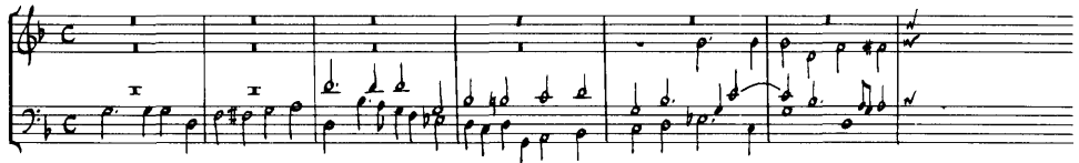
Example 2: Ricercar style: Frescobaldi, Recercar dopo il Credo 56

The ricercar is the other style of the stile antico ; a work of serious contrapuntal invention upon a relatively short sequence of long notes as a subject, it derives its style from the sixteenth-century motet and shares with the cantus firmus style the expression of the absolute, the normative, and the objective.