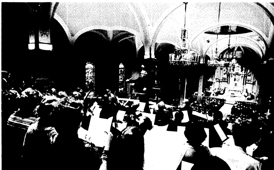
Church of Saint Agnes, Saint Paul, Minnesota. November 22, 1977, Feast of Christ the King. Twin Cities Catholic Chorale and members of the Minnesota Orchestra. Beethoven's Mass in C .