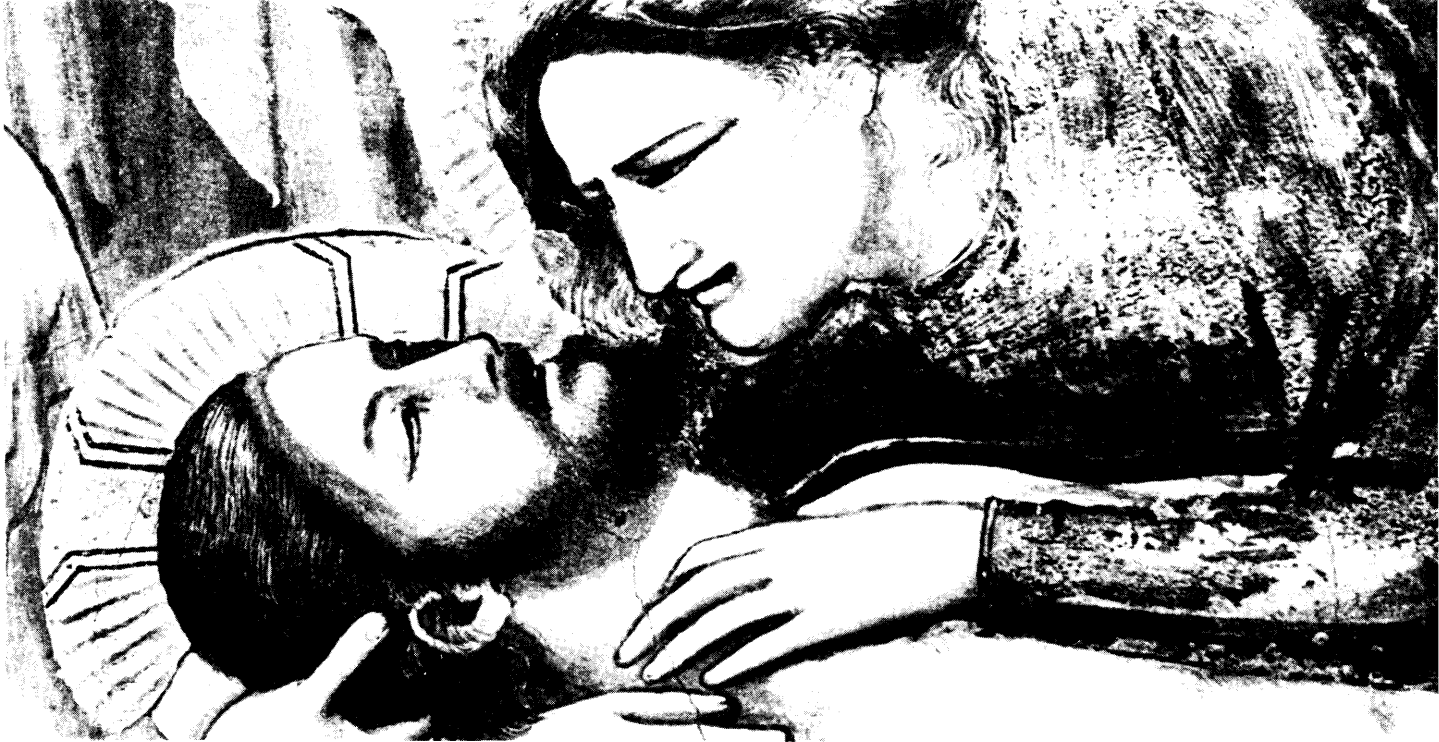
Giotto. The Entombment .