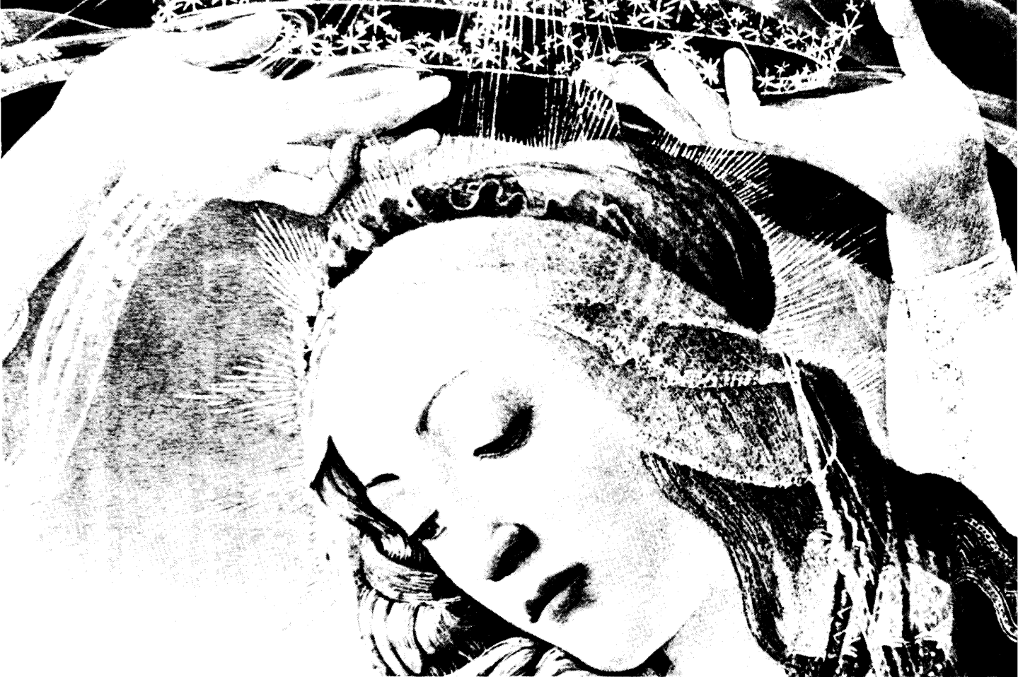
Botticelli. The Virgin of the Magnificat .