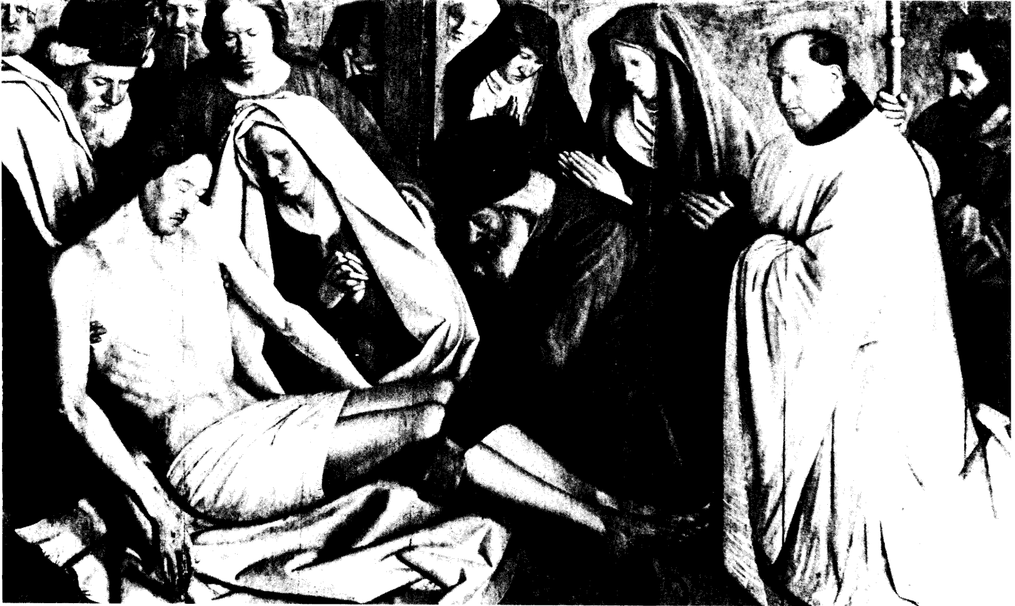
Studio of Jean Fouquet. The Deposition.