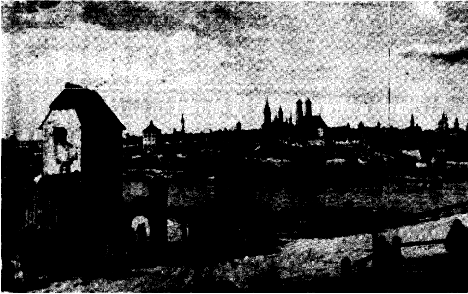
A view of Munich