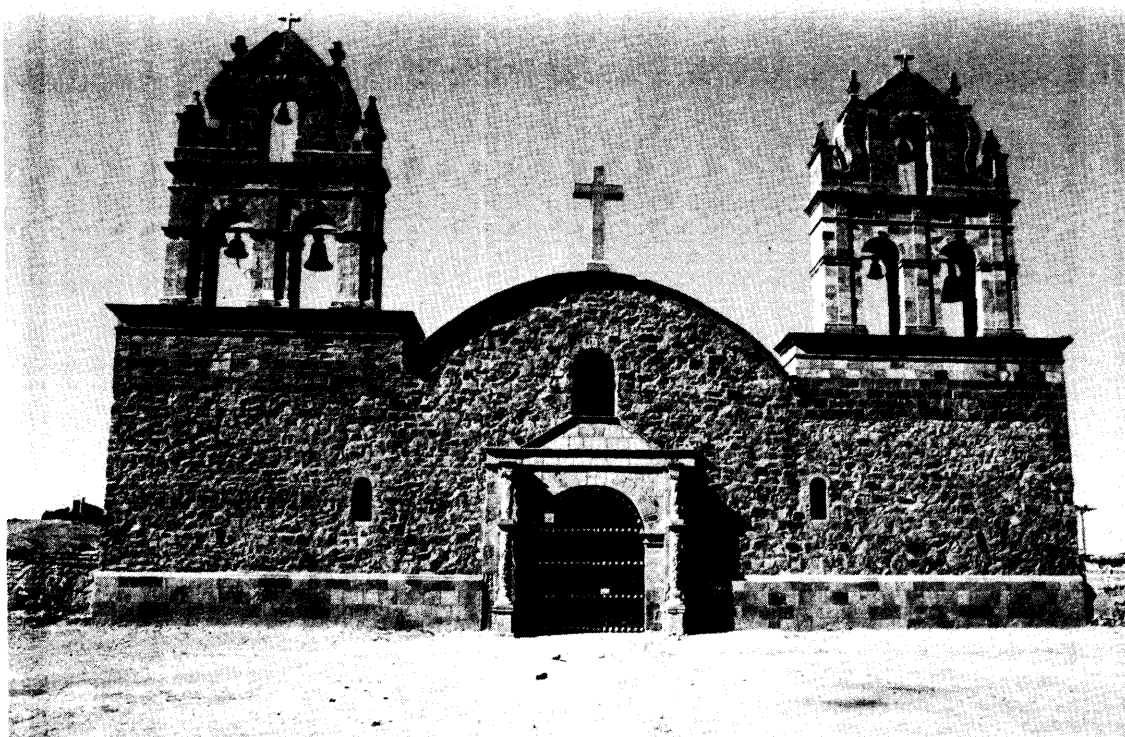
Church of the Pueblo of Laja, Bolivia