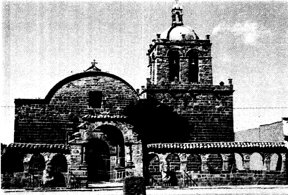
Church of Tiwanaku in Puerta del Sol, Bolivia