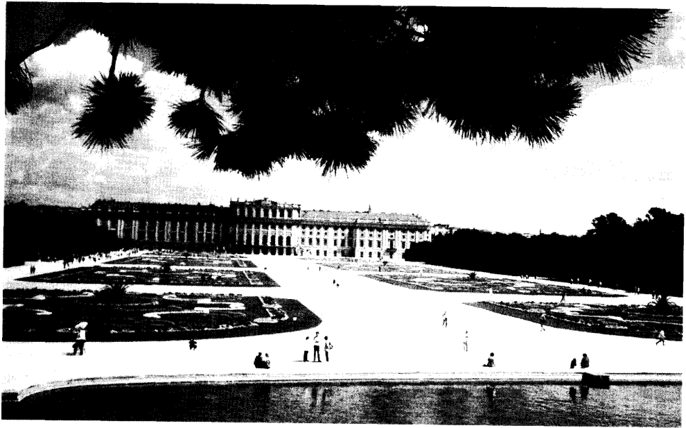
Vienna. Schönbrunn Palace