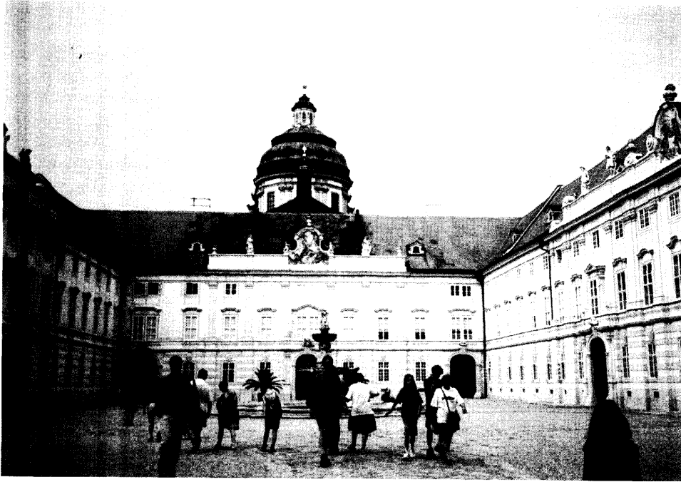
Austria. Melk Abbey