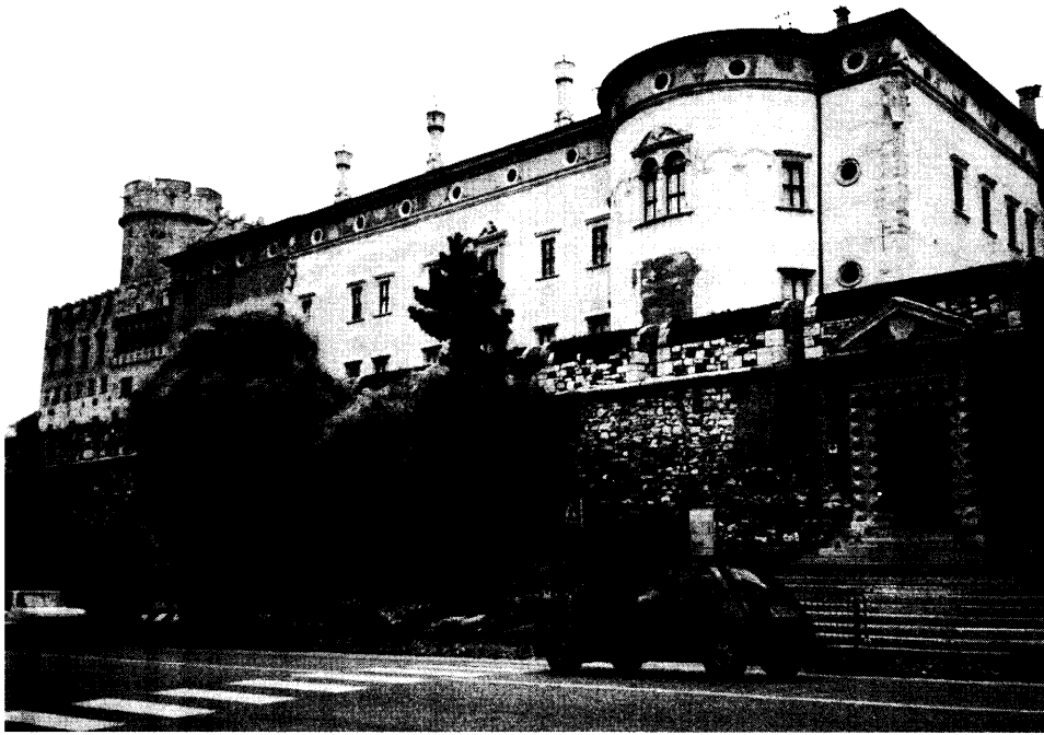
Trent. Castle of Good Counsel