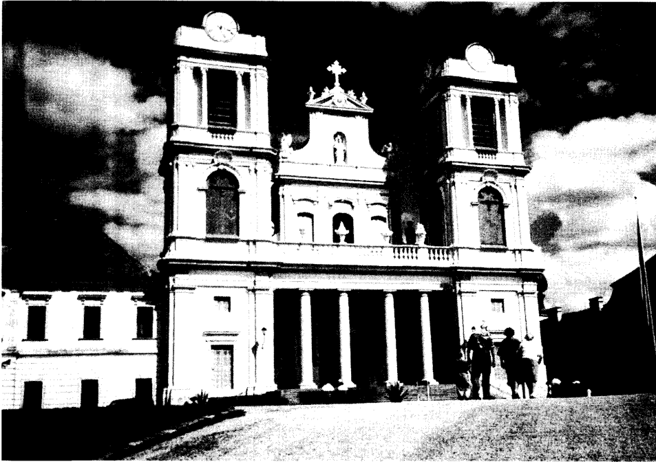
Austria. Göttsweig Abbey