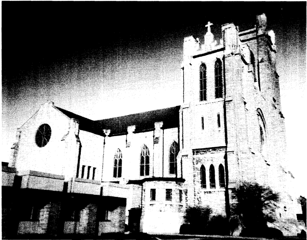
St. Mary's Cathedral, Lansing, MI