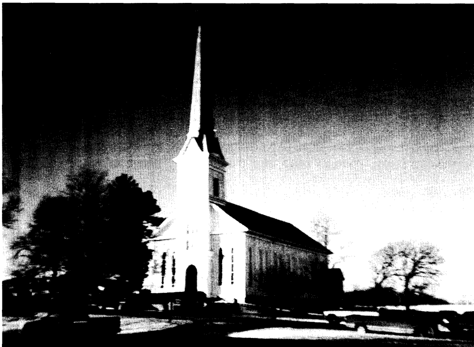
St. Patrick's, Parnell, MI