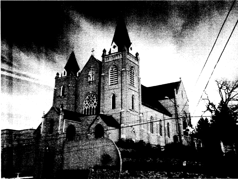
St. Isidore's, Grand Rapids, MI