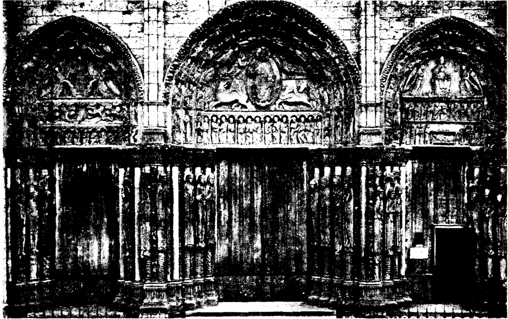
West Portal. Cathedral, Chartres Early Gothic. c. 1145