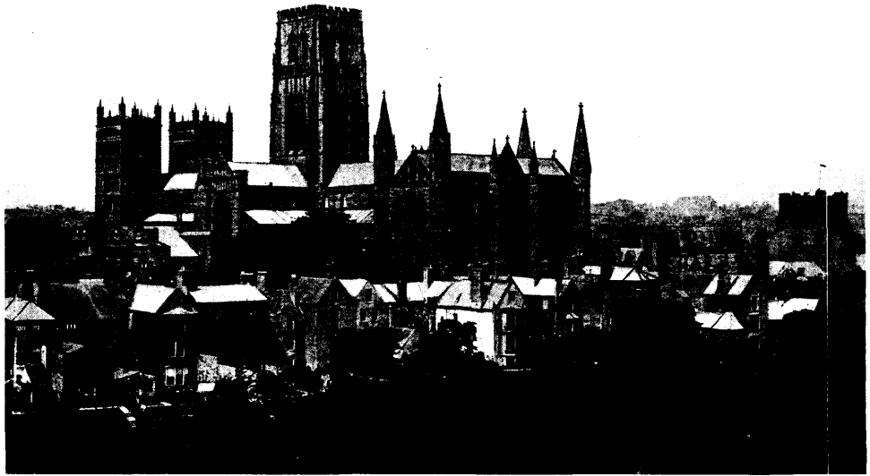
View from Southeast. Cathedral, Durham Romanesque (Norman) and Gothic. Chiefly 1093—1133